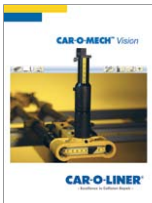
Car-O-Mech software along with Car-O-Data allows you to precisely target the correct measuring point.