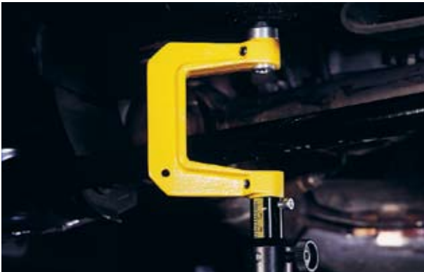
The universal M217 measuring adapter is useful for those hard to reach measuring points.