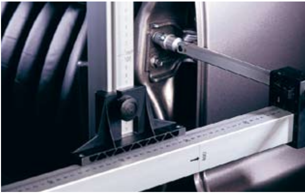
Upper body measuring points are easy to reach with the M900 upper body measuring system.

made in close co-operation with vehicle manufacturers around the world. These exact measuring specifications help you increase productivity by eliminating uncertainties before, during and after repairs.