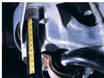
Measuring tube and adapter fits over bolt head in tight places.