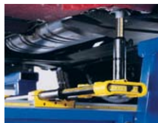
Length, width and height can be easily read at a glance for unsurpassed accuracy.